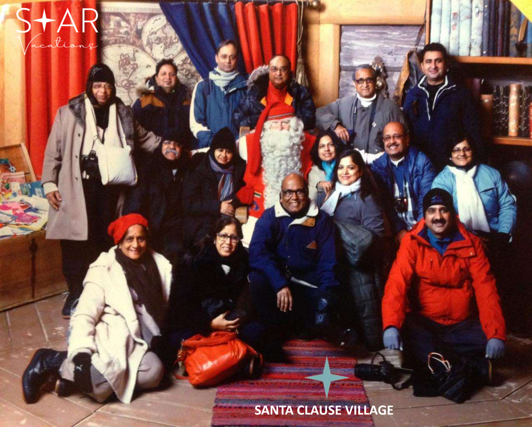
SANTA CLAUSE VILLAGE

Post Reindeer farm, visit Santa's village and Santa's post office , the most famous tourist spots in Lapland. Cross the Arctic Circle and receive a certificate as a keepsake. At Santa's post office, you can send cards with special Arctic Circle postmarks. Experience the magic of childhood dreams by meeting Santa himself in his office and buying souvenirs. Later, drive to the hotel, check in, and relax.