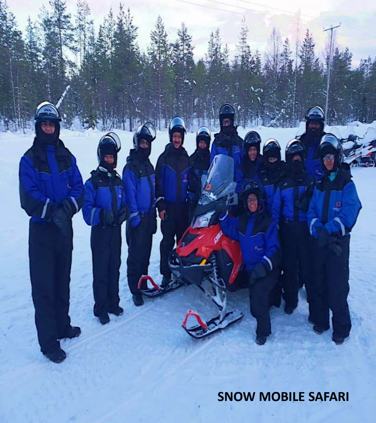
SNOW MOBILE SAFARI